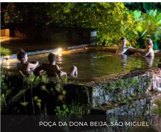
POÇA DA DONA BEIJA, SÃO MIGUEL