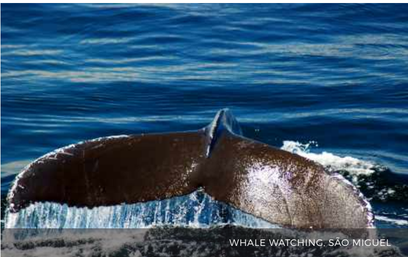
WHALE WATCHING, SÃO MIGUEL