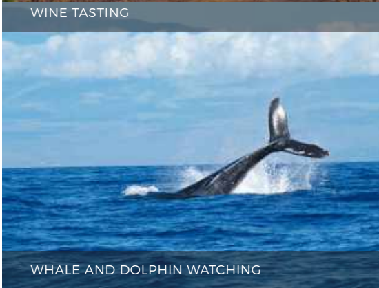
WHALE AND DOLPHIN WATCHING