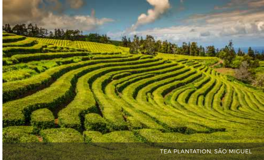
TEA PLANTATION, SÃO MIGUEL