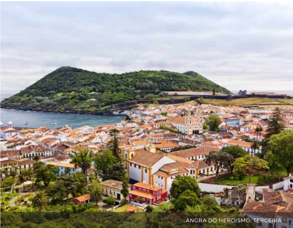
ANGRA DO HEROISMO, TERCEIRA