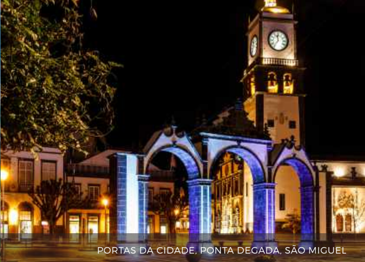
PORTAS DA CIDADE, PONTA DELGADA, SÃO MIGUEL