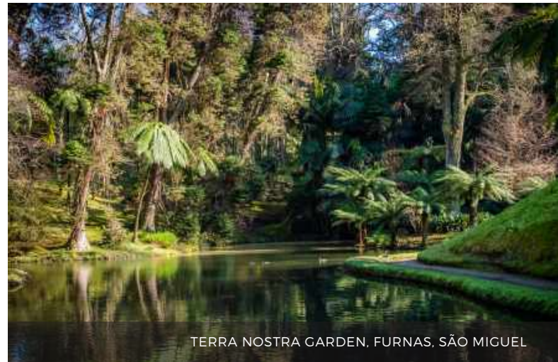
TERRA NOSTRA GARDEN, FURNAS, SÃO MIGUEL