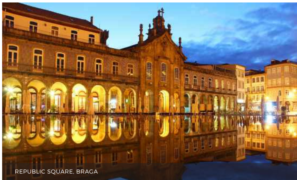
REPUBLIC SQUARE, BRAGA

Visit and explore some of the most unique and charming cities of Portugal: Porto (UNESCO World Heritage Site), Lisbon (UNESCO World Heritage Site), Guimarães (UNESCO Cultural Heritage of Humanity), Braga and Sintra. While you tour these breathtaking cities you will also get a chance to stop, enjoy and taste traditional local foods and wines. Be prepared to fall in love with the uniqueness of each place.