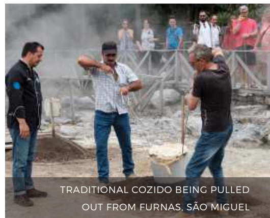
TRADITIONAL COZIDO BEING PULLED OUT FROM FURNAS, SÃO MIGUEL