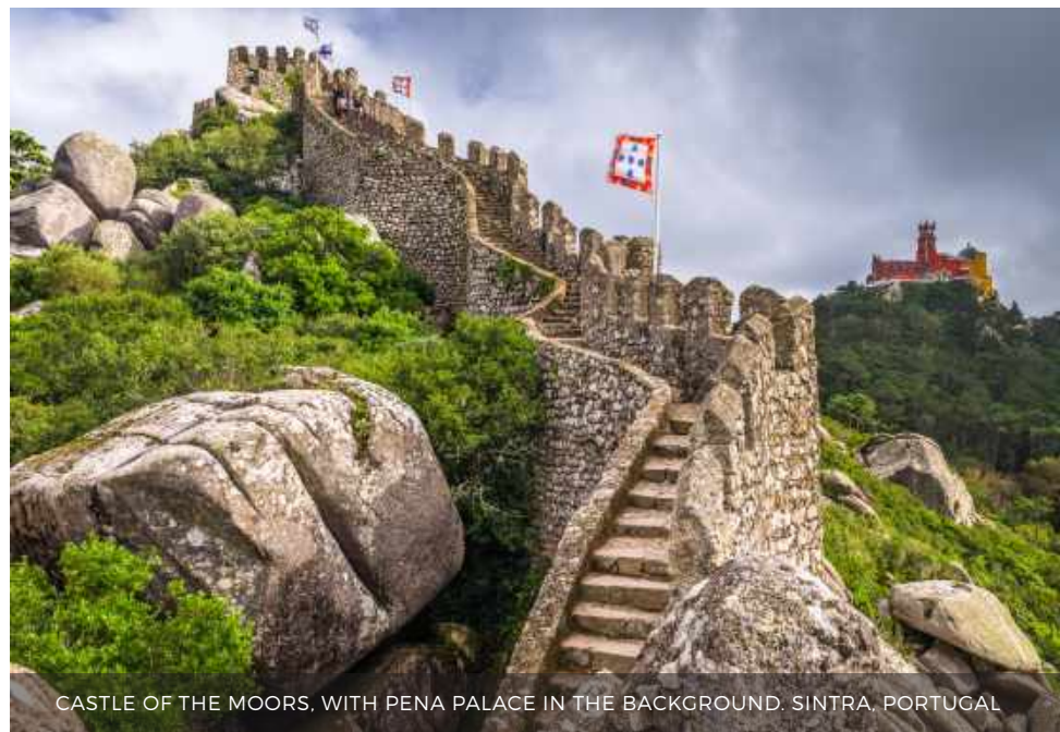
CASTLE OF THE MOORS, WITH PENA PALACE IN THE BACKGROUND, SINTRA, PORTUGAL

and a final visit to the Coaches Museum, where you will be able to see the horse drawn carriages from the Royal House of Portugal. You will be able to sample the famous Pastéis de Belém. The tour then continues onto the Alfama, Lisbon’s oldest quarter, where fado music is heard at night. You return to your hotel in the early evening.