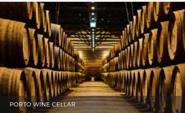
PORTO WINE CELLAR

DAY 1 You will be transferred to your centrally located hotel in the city of Porto after arriving at the airport. In the afternoon you will meet for a half-day tour of the city of Porto. The “Invicta City”, is Portugal’s second biggest city. On your half-day tour you will visit the following sites: The “São Bento” train station, known for its azulejo patterns that tell stories of the history of Portugal. “Torre de Clérigos” and “Igreja”, a