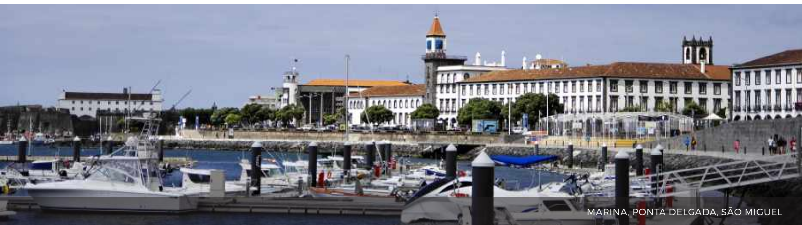
MARINA, PONTA DELGADA, SÃO MIGUEL