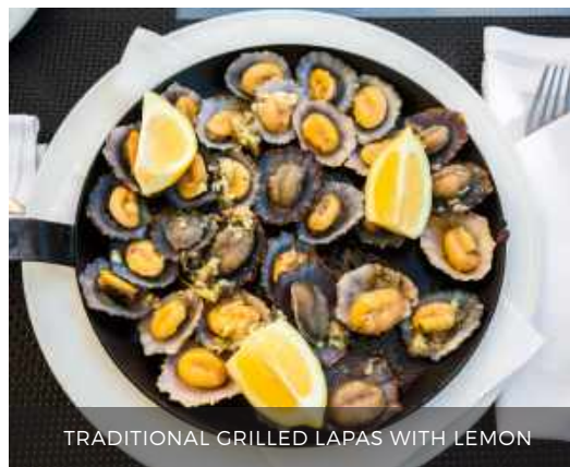
TRADITIONAL GRILLED LAPAS WITH LEMON