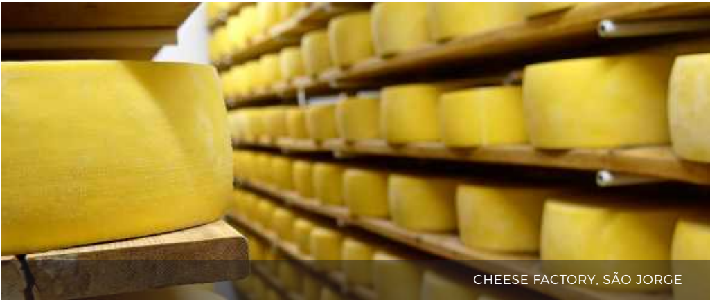
CHEESE FACTORY, SÃO JORGE