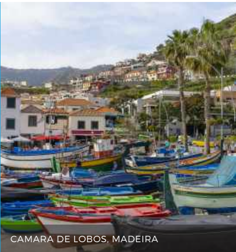
CAMARA DE LOBOS, MADEIRA

DAY 1 You will arrive at Madeira's Airport, where a representative will meet you and bring you to your hotel after clearing customs. You will have the rest of the day to relax and explore the city of Funchal.