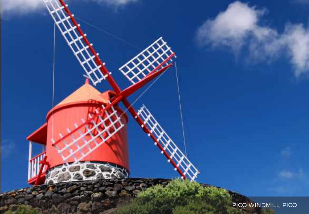
PICO WINDMILL, PICO

DAY 9 Today we make our way back to the airport, for a quick flight to the island of Terceira, upon arrival you will be transferred to Hotel and the rest of the day